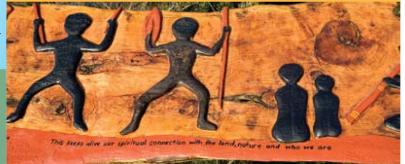
The trees give our spiritual connection with the land, nature and who we are

... keeping alive our connection with the land and sea